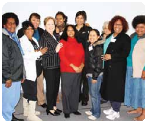
▲ INDIGENOUS LADIES LAUNCH Moree launches its first women's ministries retreat, see the full story on page 6 ►