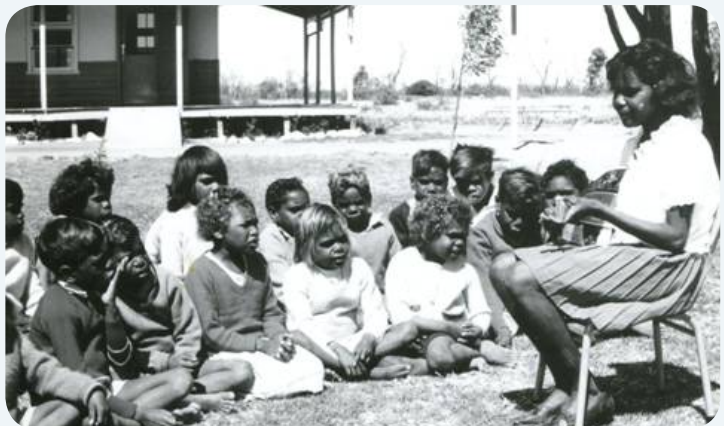
▲ KARALUNDI CIRCA 1967 Students taking note of their Aboriginal teacher