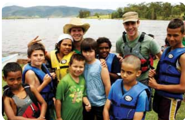
▲ ACTIVITIES FOR EVERYONE Some of those who attended the first Dreamtrack Club – Somerset Dam, QLD