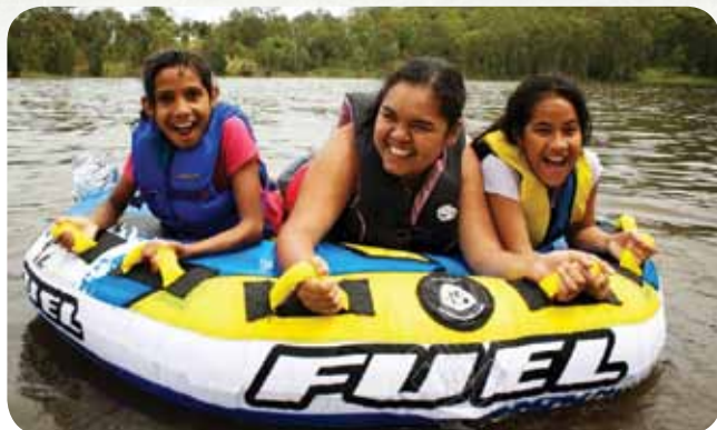
▲ HOLD ON TIGHT Girls bracing themselves for the water excitement – Somerset Dam, QLD