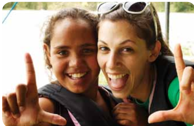
▲ SMILE IF YOU'RE HAVING A GREAT TIME You can see by these faces. that they've had a great day! – Somerset Dam, QLD