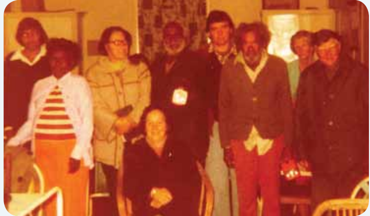
▲ MUNGINDI 1978 Avondale Students Aerial Outreach conducted a week-long evangelistic series

We all love to see 'old' photos. Please send in your photo so we can share it with everyone who reads goodnews .