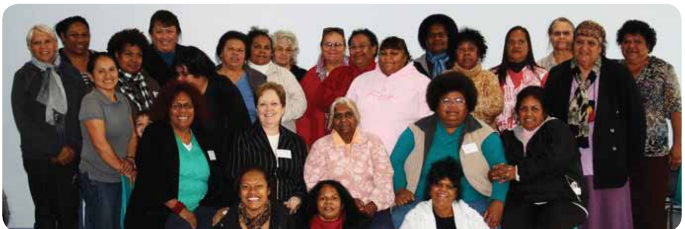
▲ EMPOWERED LADIES Those who attended the first indigenous women's retreat – Moree, NSW