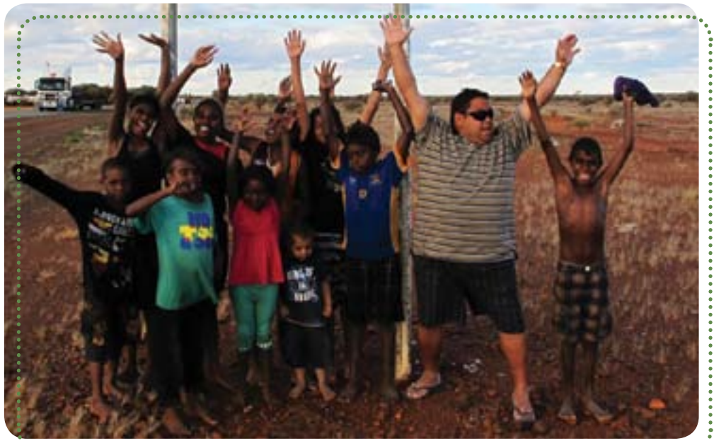
▲ THREE CHEERS FOR COUNTRY MUSIC! Attendees of Karalundi's first Country Gospel Music Festival enjoyed an afternoon sightseeing, see the full story on page 4 ►