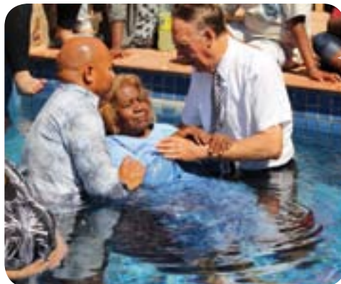
▲ MORE BAPTISMS from Coober Pedy and Marree, see the full story on page 5 ►