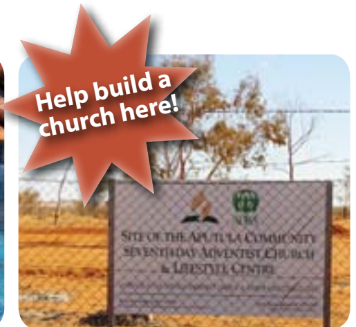
▲ HOW CAN YOU HELP RAISE FUNDS FOR FINKE? The Finke needs your support now, read more on page 15 ►