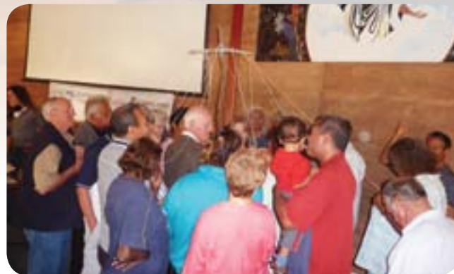
▲ PULLING HEARTSTRINGS Worships were powerful at the music festival – Karalundi, WA