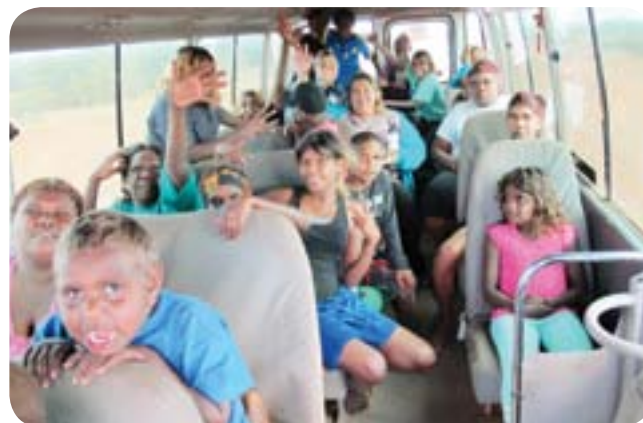
▲ FESTIVAL OUTING Where would the festival been without an outing to Tunnel Hill and Bilyuen Pool – Karalundi, WA