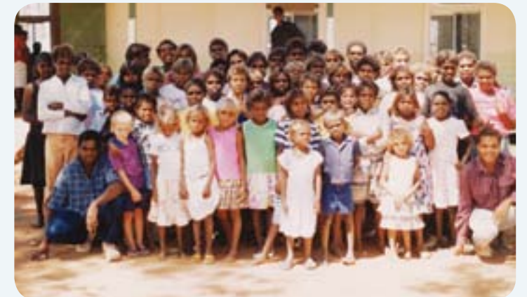
▲ KARALUNDI CIRCA 1987 Students