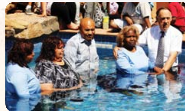
▲ FIRST BAPTISMS FROM SURROUNDING AREAS These are the first people from Marree to be baptised into the Seventh-day Adventist Church – Coober Pedy, SA

In an echo of the catacombe worship services of the first century, prayers of blessing have been offered during a regional meeting at a new underground church in Coober Pedy, a South Australian opal mining town in the desert midway between Adelaide and Alice Springs.