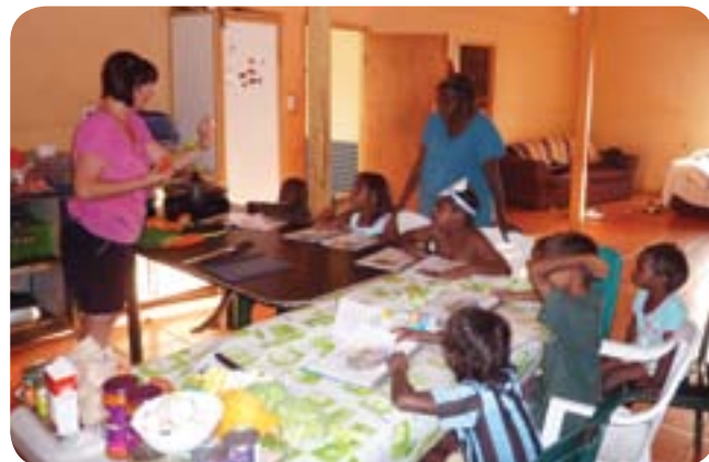
▲ HEALTHY CLASSES FOR THE KIDS While the classes were aimed at the women in the community, the children were keen too – Mowanjum, WA